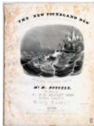
THE NEWFOUNDLAND DOG

[SHEET MUSIC] The Coldstream Guards March by Stephen Glover London. n.d. (Ca.1850s) Impressive color lithograph of The Prince of Wales in bold red with guards behind him. 5 pp.; Large format. Spine separated. Edges show evidence of being formerly bound. Tiny amount of foxing. Very Good. $175