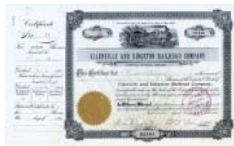
ELLENVILLE & KINGSTON RR CO. A UNIQUE MORGAN VARIETY!

Just In! We have just received for sale, on behalf of a private client, a fine collection of stocks, bonds, documents and letters signed by and related to J. Pierpont Morgan. This collection is the finest of it's type that we are aware of. The items herein are just a small representation of its scope. Please ask for a complete listing of items available from this outstanding collection.