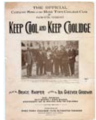
1924 POLITICAL SHEET MUSIC: KEEP COOL AND KEEP COOLIDGE