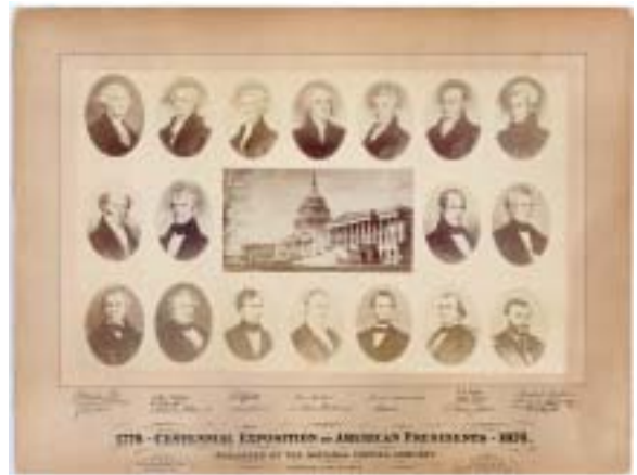
A CENTENNIAL EXPOSITION HALL OF PRESIDENTS

[AFRICAN AMERICANS/ POLITICAL] Rare Republican Campaign Circular for Grant: The Party of Freedom and Its Candidates. The Duty of the Colored Voter. Washington: Published by the Union Republican Congressional Committee [1868], 4 pp. Illustrated with woodcut of Lincoln "The Emancipator" and of Grant, "His Successor." Interesting question and answer series aimed at "newly made citizens," that is emancipated slaves, in the form of a dialog between "a newly made citizen and a Radical Republican" on reasons why African Americans should vote Republican. Monaghan 908. A tad frayed at very edges, overall Fine. $1,250