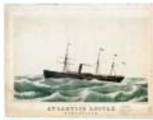
NICE COLOR LITHOGRAPH OF SHIP ON SHEET MUSIC

[SHEET MUSIC] Color Lithograph Queen Victoria's Dances by E. Ferrett & co. NY & Philadelphia. n.d. 15 pp. Bordered in blue and showing the royal couple dancing. Few dots and slight amount of wear. Last page has 20th century tape to small portion. Very Good. $175