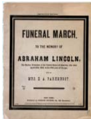
FUNERAL MARCH SHEET MUSIC THE NATION MOURNS ABRAHAM LINCOLN