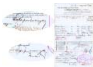
J. PIERPONT MORGAN AS TREASURER OF THE AMERICAN MUSEUM OF NATURAL HISTORY