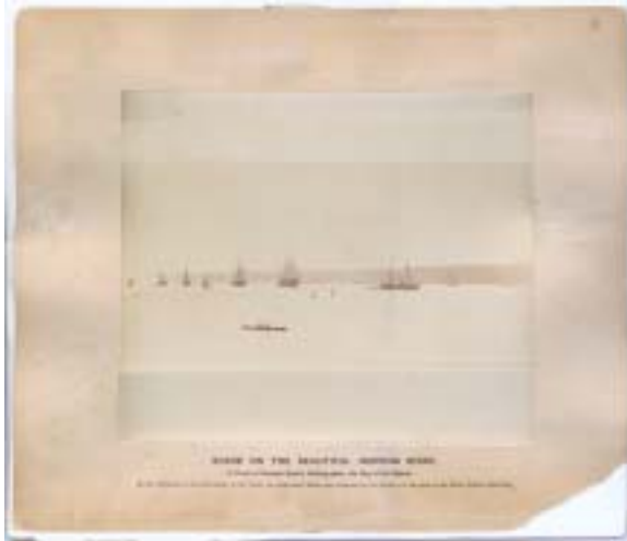
ON THE OCCASION OF GENERAL GRANT'S FUNERAL "SCENE ON THE BEAUTIFUL HUDSON RIVER"

Large Format albumen photograph 11½" x 10"; 17 ¼ x 15" with mount. "In Front of General Grant's Resting Place, the Day of the Burial - At the conclusion of the ceremonies at the Tomb, the Regimental Salute was answered by the thunder of the guns of the North Atlantic Squadron." Tan mount shows flaws, light soiling, torn corner, small tear at center, some white drop staining; photograph itself is fine and depicts several ships in the river, in the foreground, two men in a long canoe $325