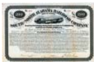
SOUTH AND NORTH ALABAMA RAILROAD COMPANY BOND SIGNED BY MORGAN AS TRUSTEE