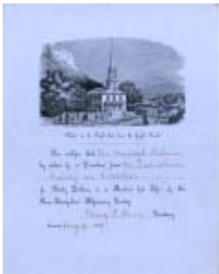
NEW HAMPSHIRE MISSIONARY SOCIETY

Large Format albumen photograph 11½" x 10"; 17 ¼ x 15" with mount. "In Front of General Grant's Resting Place, the Day of the Burial - At the conclusion of the ceremonies at the Tomb, the Regimental Salute was answered by the thunder of the guns of the North Atlantic Squadron." Tan mount shows flaws, light soiling, torn corner, small tear at center, some white drop staining; photograph itself is fine and depicts several ships in the river, in the foreground, two men in a long canoe $325