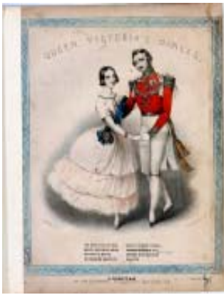
QUEEN VICTORIA'S DANCES

[SHEET MUSIC] Color Lithograph Queen Victoria's Dances by E. Ferrett & co. NY & Philadelphia. n.d. 15 pp. Bordered in blue and showing the royal couple dancing. Few dots and slight amount of wear. Last page has 20th century tape to small portion. Very Good. $175