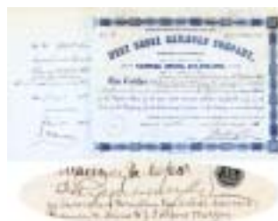
WEST SHORE RAILROAD CO. - A UNIQUE MORGAN VARIETY!

1874. Bond for 200 pounds sterling bearing 6% interest. Black. Lovely engraved vignette of a steam locomotive in foreground of a panoramic river view. Coupons below. Signed on verso by Morgan as a trustee of the railroad. The road originated during the Civil War to quickly connect the Red Mountain iron and coal fields to Selma, Alabama and utilized the route that had been previously surveyed for the Alabama Central Railroad. It operated about 17 miles from the Cahaba River to the Alabama & Tennessee River Railroad at Calera. Uncancelled and Very Fine. $3,000