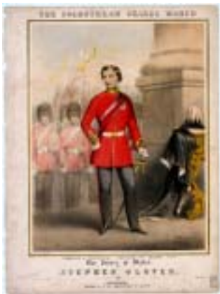
COLOR LITHO: THE PRINCE OF WALES THE COLDSTREAM GUARDS MARCH

[SHEET MUSIC] Keep Cool and Keep Coolidge, music by Bruce Harper, words by Ida Cheever Goodwin; published by Home Town Coolidge Club, Plymouth, VT, 1924. 3pp. Photographic image of the Home Town College Club Quartet from Plymouth Vermont at the White House in 1924. 3 fold marks with minor separation. Small tear with a little loss, o/w Very Good. $50