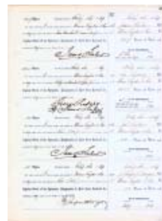
SYRACUSE, BINGHAMTON & NEW YORK RAILROAD CO. TRANSFER DOCUMENT SIGNED BY MORGAN

Issued to Cornelius Vanderbilt, Chauncey M. Depew and J. Pierpont Morgan , the survivors & survivors of them are the owner of 99,935 shares. Stock #26 for 99,935 out of total company shares of 100,000. Survivors agreement between 3 prominent financiers. Cornelius Vanderbilt died before the date of the transfer. Certificate #17 issued on 12-5-1885 for 99,935 shares became certificate #26 issued to same 3 people with survivorship language. Signed on attached stock power by Chauncey M. Depew and J. Pierpont Morgan as survivors of Cornelius Vanderbilt, deceased. A large amount of shares in this company. UNIQUE - This is the only example of this company signed by Morgan! The stock is punch cancelled, the stock power is unaffected. $3,000