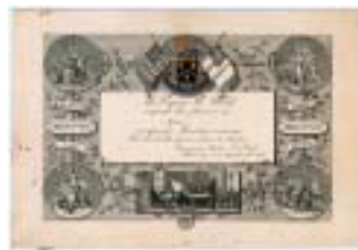
CYRUS FIELD 25TH YEAR ANNIVERSARY CELEBRATION BY TIFFANY